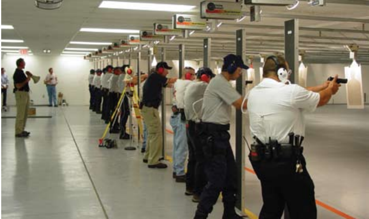
Figure 2. Noise and lead exposure assessment of law enforcement officers at a 20-lane indoor firing range.

technicians, gunsmiths, and firing range instructors. The evaluations also included the potential for take-home lead contamination of workers' vehicles and homes, and for exposure of their families.