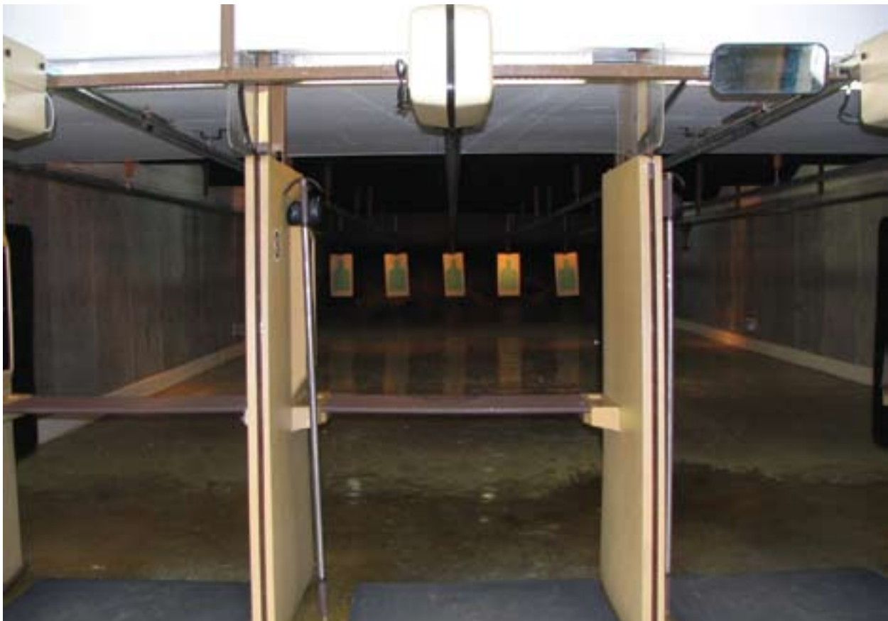
Figure 1. A law enforcement agency five-booth indoor firing range.

The Alaska Environmental Public Health Program initiated a statewide review of school-sponsored rifle teams after a team coach was found to have an elevated BLL of 44 \mu\text{g}/\text{dL} [State of Alaska 2003]. The review initially examined six rifle teams using three indoor firing ranges. Thirty-six students and 35 adults (including family members and 6 coaches) participated in the blood lead