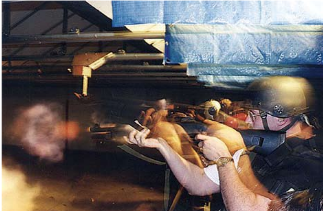
Figure 3. Emissions from the discharge of firearms.

shotgun, and Bushmaster M4 .223-caliber assault rifle). Indoor and outdoor measurements were also obtained for the Smith and Wesson .357-caliber revolver, the Colt .45-caliber and 9-mm pistols, the Glock .40-caliber pistol, the Heckler & Koch H&K 53 and H&K 36 assault rifles, and Colt AR15 .223-caliber rifles. Measurements were conducted using a ¼-inch Bruel & Kjaer model 4136 microphone, digital audio tape recorders with a 48 kHz sampling rate or were acquired directly to a computer laptop using 96 kHz data acquisition board. Analyses on the digitized waveforms were conducted using software tools built in Matlab. Peak sound pressure levels ranged from 155–168 dB SPL. Figure 4 shows the peak sound pressure levels generated from various weapons at an indoor firing ranges. A-weighted, equivalent (averaged) levels ranged from 124–128 dBA. Hearing protectors were